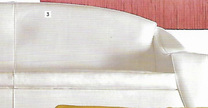
1. Creed semi-round lounge sofa , Dhs 25,561, Minotti 2. Fridges sofa , Dhs 31,205, Munna 3. Marco leather sofa , from Dhs 18,934, Mascheroni 4. Tassello sofa , Dhs 103,700, Bottega Veneta